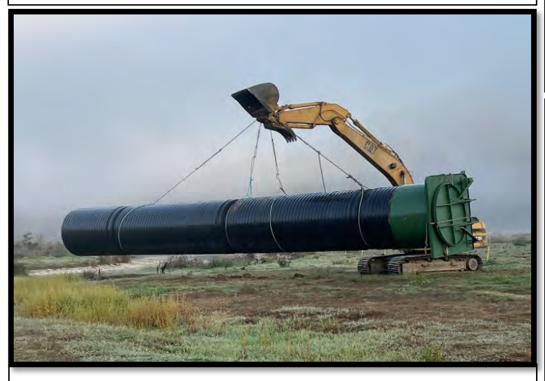
Join us and our partners for a post tide gate installation tour in the near future!

Umpqua SWCD can assist you with your tide gate replacement project(s)!