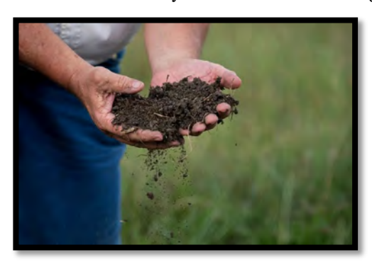
"To be a successful farmer one must first know the nature of the soil."

We're looking forward to visiting with you in Elkton at the Elkton Community Education Center on August 20<sup>th</sup>!