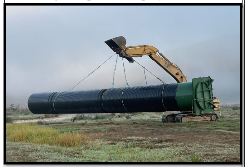
Join us and our partners for a post tide gate installation tour in the near future!