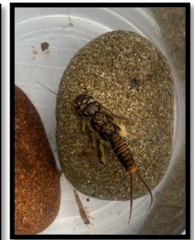
Mayfly & Stonefly Nymphs